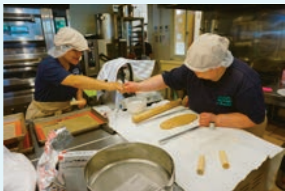
Workers at CAFÉ Sweet Hot in Koriyama City cutting "Polvoron" out of pastry dough. (September, 2014)